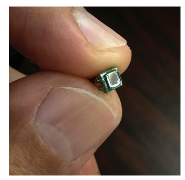
Multispectral Sensor Chip